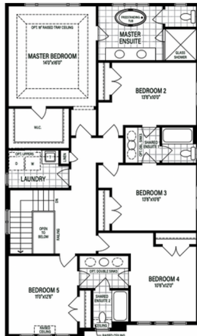
Optional Second Floor